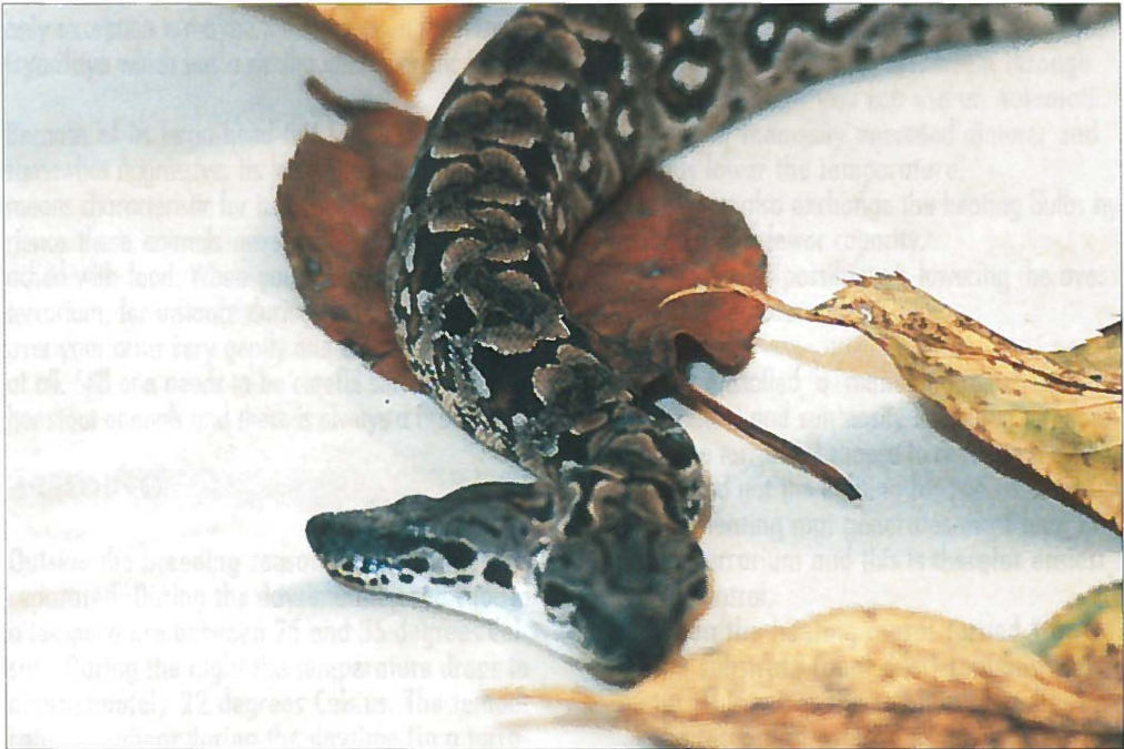
Acrantophis dumerili .

Something about the Dumerilli in general. It is a Boa that occurs on Madagascar. Comparing the zanzinia and also Acrantophis madagascariensis it is clear that they are related although each species has evolved and adapted under its own con-