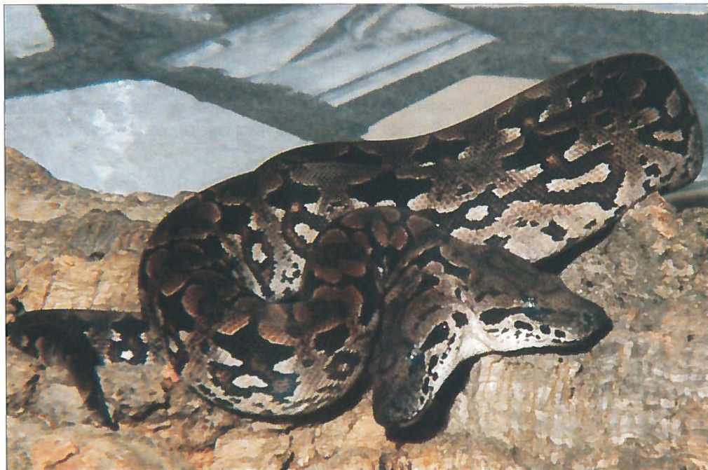
Acrantophis dumerili .

open till about one o'clock, then we had to stop to sleep for some hours in the car. So around ten in the morning we arrived at my house. My plan was to quickly put the snakes where they belong and then spend some hours on the couch. When I opened the door of the snake room I noticed this typical smell that I immediately associated with baby snakes being born. Okay, lets have a look then. All I could see was a big mess with in the middle one baby lying on its back while the mother was lying in a far corner. I was not very happy with this situation and I went out to get a bag to clean things up. I took the young out and then my friend cried out "it's got two heads!!!". I had not yet noticed it but he was right.. I was astonished and it even was alive. So, better put her apart which is what we did. The little animal quickly buried itself